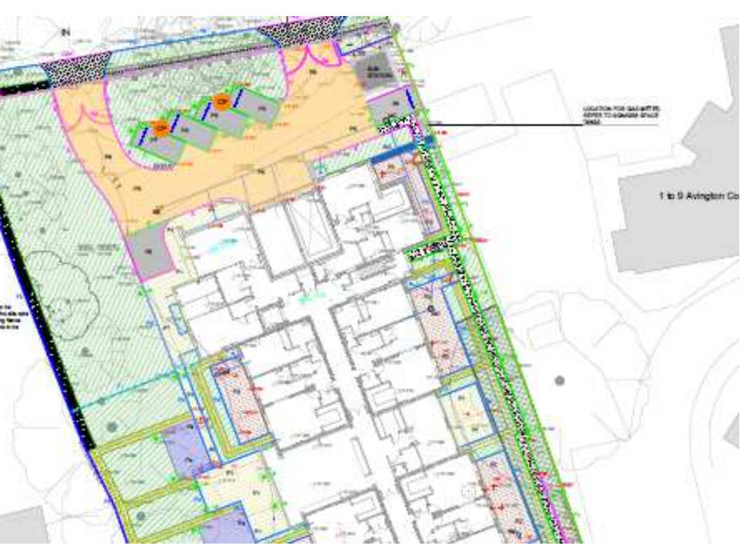
Proposed landscaping - north