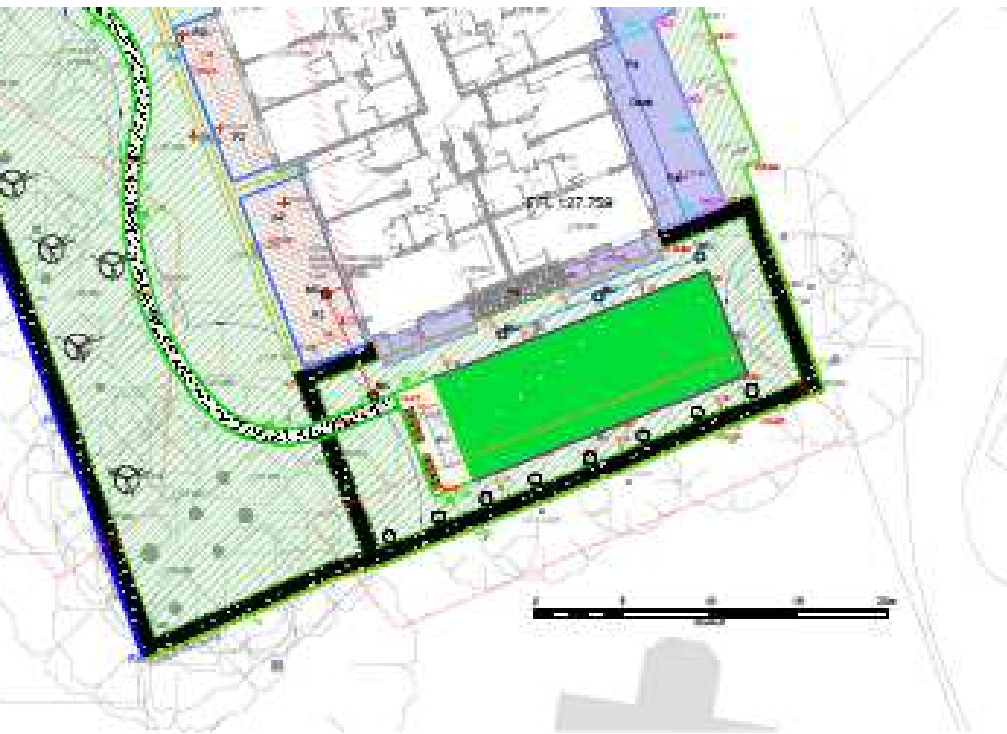
Proposed landscaping - south